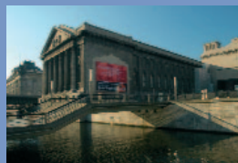
Right: Pergamon Museum, Museumsinsel Berlin