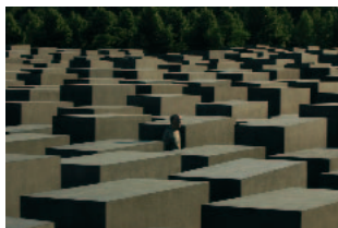
Above: Holocaust Memorial "Denkmal für die ermordeten Juden Europas," Berlin-Mitte