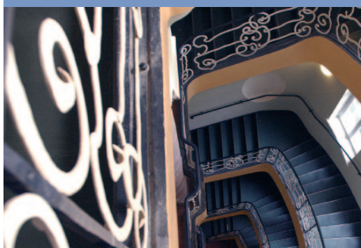
Neobaroque stairwell with Art Nouveau elements (1896–1905), Langericht Berlin (district court)